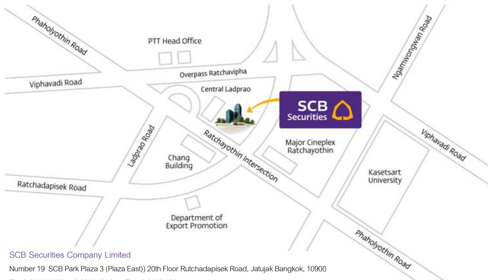
Map of the venue for for Contact Place for the Exercise

Number 19 SCB Park Plaza 3 (Plaza East)) 20th Floor Rutchadapisek Road, Jatujak Bangkok, 10900